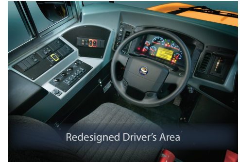
Redesigned Driver's Area